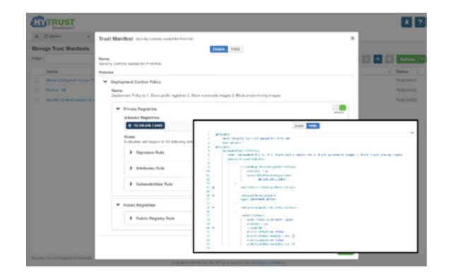
Trust Manifests create "security as code" YAML policies

Entrust pioneered advanced security for managing virtualized data centers and has scaled to meet the needs of mid-sized and large enterprises and public sector organizations. As architectures have evolved from virtual to software defined, private cloud – and now hybrid multi-cloud – CloudControl continues to be the leading option for lowering risk of data loss or downtime due to compromise or abuse of the administration interface. Entrust also continuously innovated broader capabilities across multiple dimensions, while maintaining unified policy and visibility. As a result, organizations can be assured that CloudControl is a superior strategic choice for risk management and avoiding an endless parade of point solutions with limited lifespan.